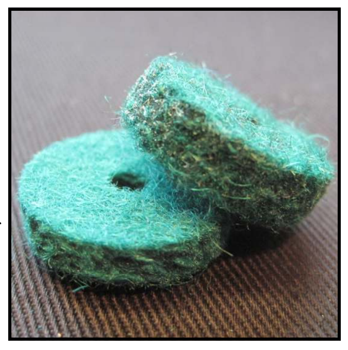
Thinnest and thickest front rail punchings.

Keybed felts come in a range of thicknesses, so that the original size of the felt installed at the factory may be duplicated. Paper and card punchings as thin as .002" are used under the felts for final adjustments necessary for level keys and even key dip.