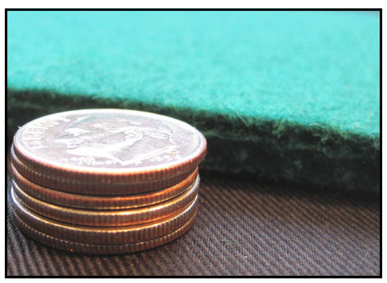
The thickness of heavy backrail cloth equals that of six dimes.